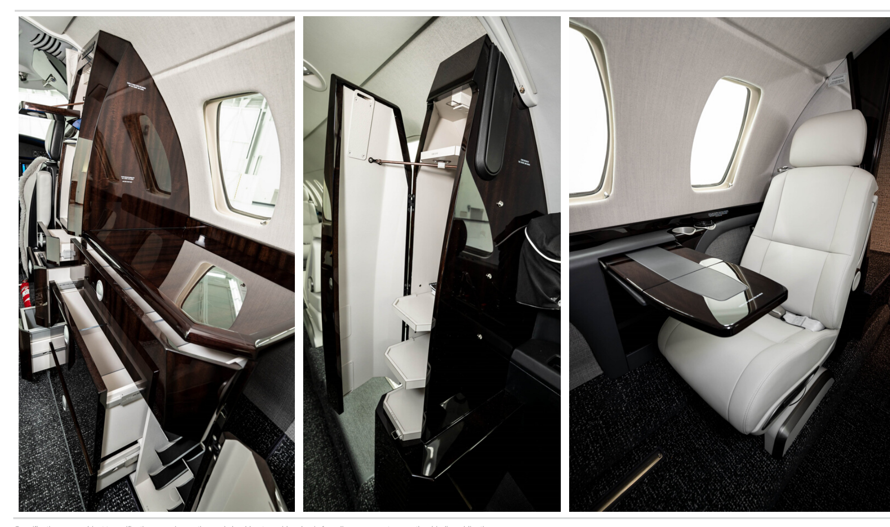
Specifications are subject to verification upon inspection and should not provide a basis for reliance or create any other binding obligation.